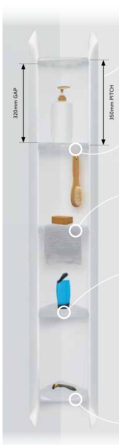
*2040/1935mm FIVE SHELF ONLY