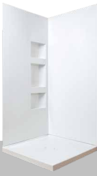
Top View (Generic - 3 sided)